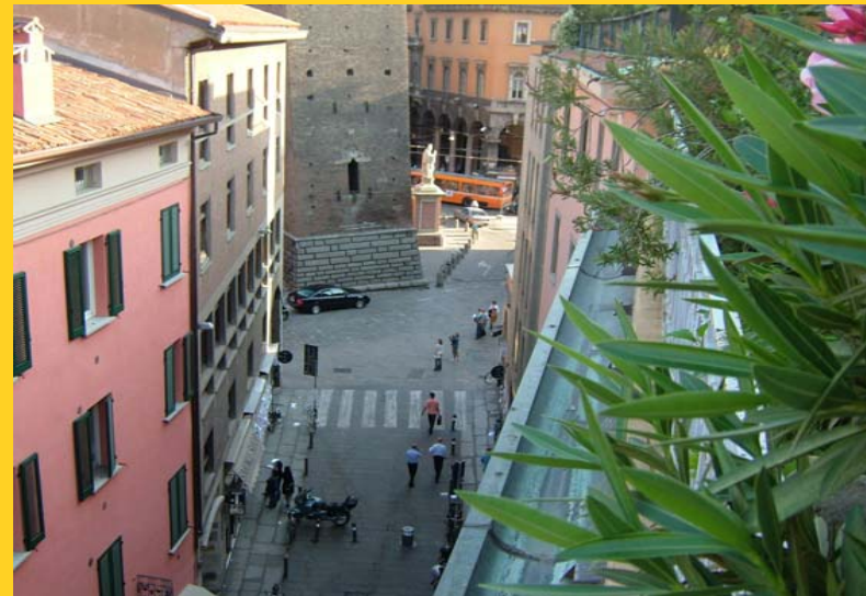
Bologna, near the university